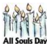
All Souls Day

Monday, November 02 is ALL SOUL'S DAY. We will have a special Holy Mass celebrated on Monday at 9:30 a.m. in commemoration of all the faithful departed. All are welcome.